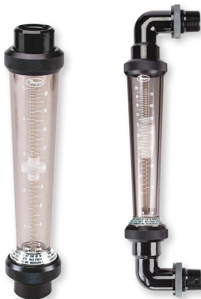
Shown with optional polysulfone fittings